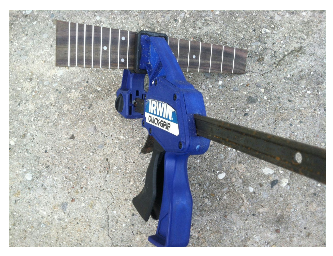
12. After fretboard is glued to neck, hand sand the board, frets ends, and neck until you get a smooth beautiful finish.

I hope you find something you can use here. Thanks for having such useful parts available.